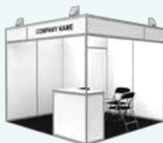
Exhibit Space Cost